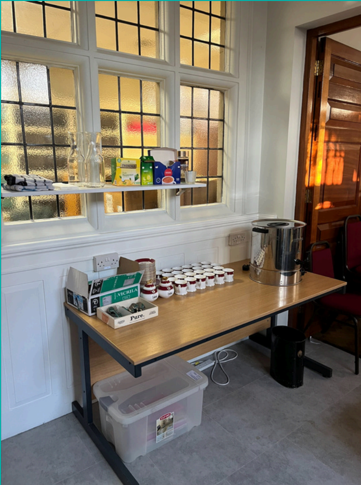
Tea and coffee-making facilities within the community space.