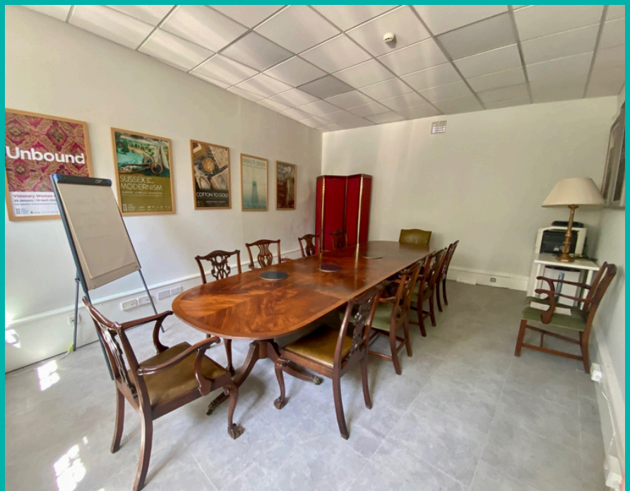
Large meeting room (subject to availability).