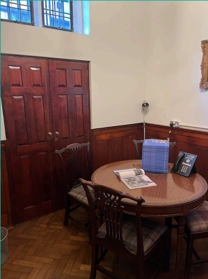
Small meeting room (subject to availability).