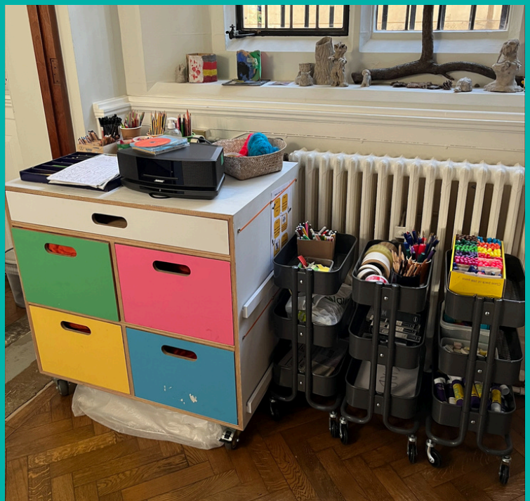
Some of the available resources.