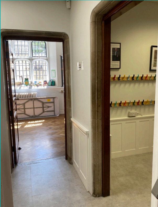
Entrance to the community space.

Additional available space next to the community room.