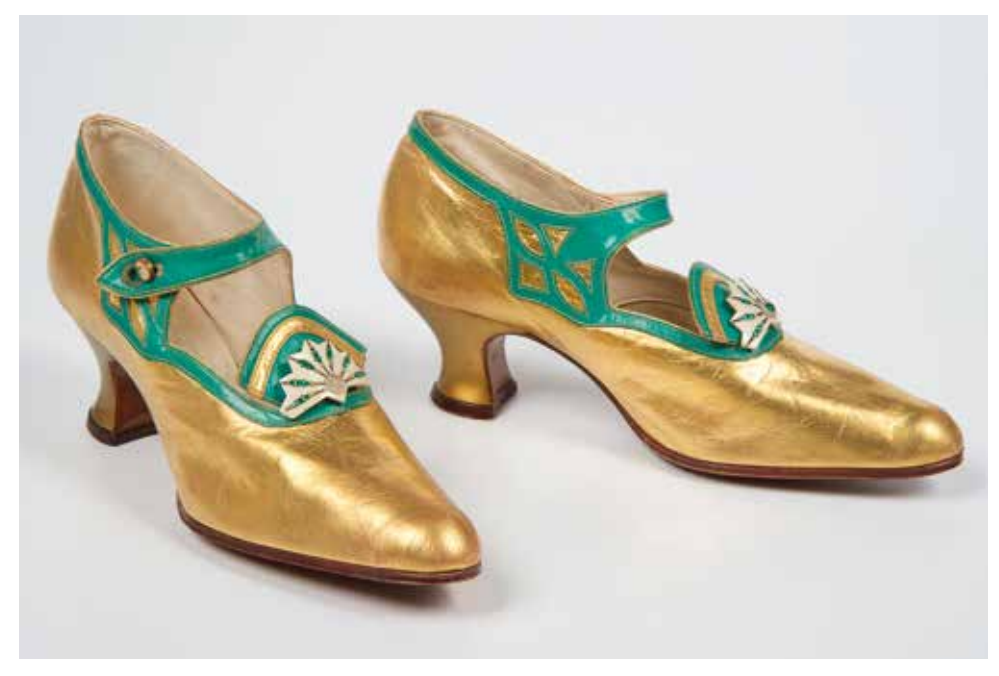
Co-operative Wholesale Society, Bar Shoes 1920-25, Gold and green leather with diamanté, Northampton Museum and Art Gallery